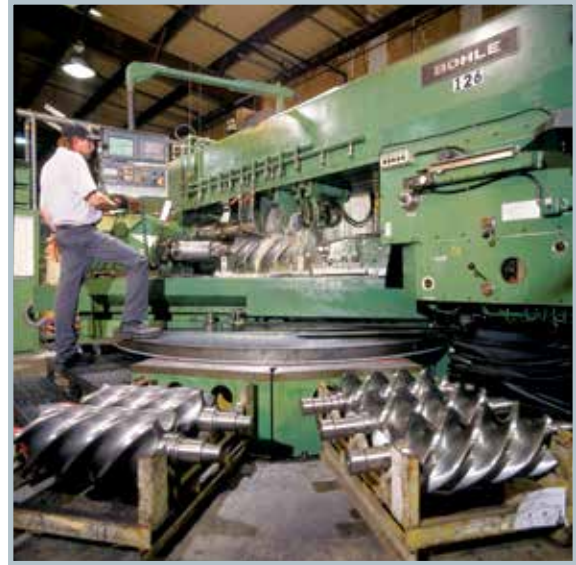
CycloBlower rotors are precision ground using state of the art milling technology.